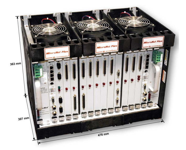
MicroNet Plus™ Control Chassis (14 VME slot option)

Full-size Chassis 14 VMENarrow Chassis 8 VME