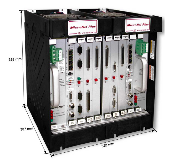
MicroNet Plus™ Control Chassis (8 VME slot option)

Power supplies may be simplex or redundant in any combination of input voltages.